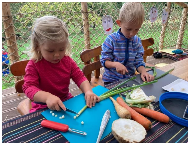
Obrázek 2 Children are preparing meals