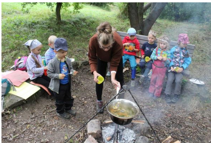
Obrázek 3 Cooking tea on fire from self collected herbs