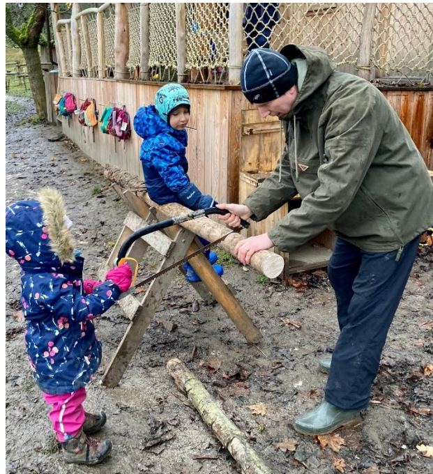
Picture 1 There are higher percentage of men as teachers in forest kindergartens in Czech Republic (ALMŠ, 2022)